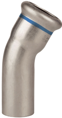
M/F 30° elbow.