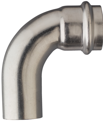
M/F 90° elbow.