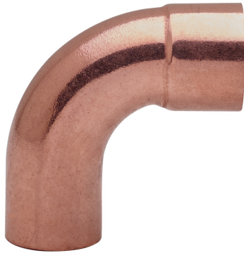
M/F 90° elbow.