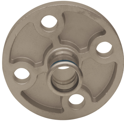
Manguito bridado PN6.