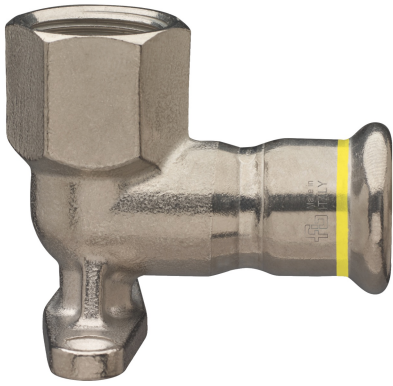
Applique coude F/filetage femelle.