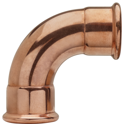
Curva 90° femmina.